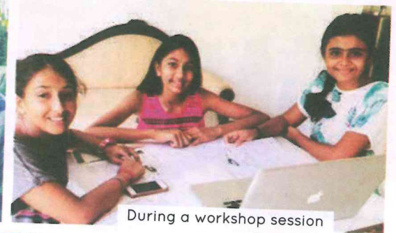
During a workshop session