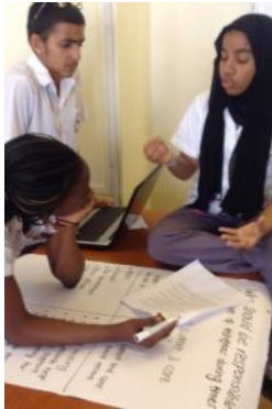
Thinking and talking about Syria

“Those who cannot remember the past, are condemned to repeat it.”