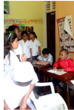
Visit to Sapling Institute

their lives, and their families and friends. The message was one of reaching out to support in any way possible those affected – be it through empathy, talking about the tragedy in an effort to understand and ensure it does not happen again, or practically, through blood donations. On the Sunday as soon as the need was communicated, 20 residential students went to the Red Cross Centre to donate blood. Sharing our experiences and supporting others are acts of humanity that enable us to move forward in a positive manner, hoping and praying that such an event is never repeated.