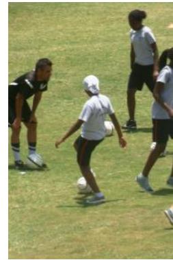
A Juventus coach does some talent spotting!

Imagine getting some hot football tips from the best. Excitement ran high when two coaches from the famous Juventus Football Club came to the Academy and ran a demo session with student groups as well as a short training session for coaches. Juventus is the most successful football team in Italy and its name is known around the world. As part of their outreach programme the team has recently set up a Soccer School in Nairobi. It is now looking to consolidate its connection with Kenya through the establishment of further schools, one being slated for Mombasa!