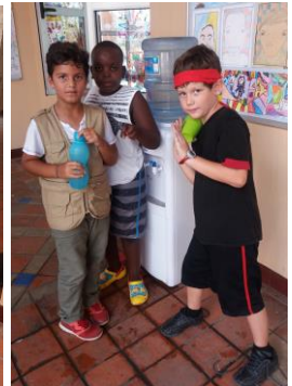
geologist, gamer and ninja spy