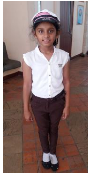
an aspiring pilot ....