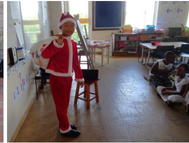
an aspiring Santa