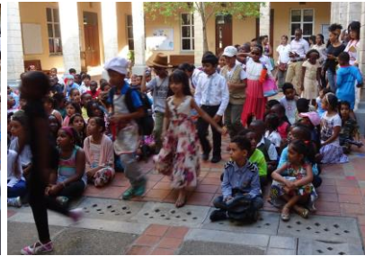
Year 2 parading their career outfits