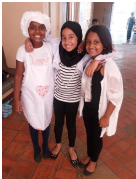
a chef, doctor and lawyer