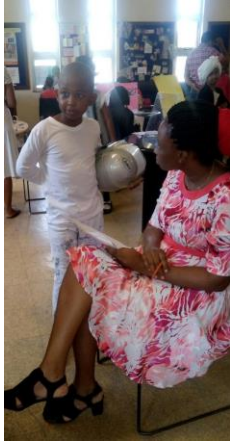
Year 3 – Exploration Unit