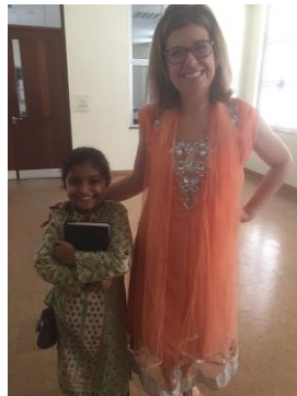
'I want to be a Principal!'