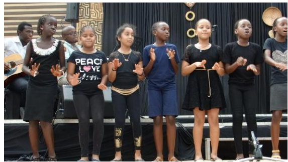
Junior School students performing at the Safaricom concert