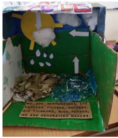
Year 4 – Cycles Unit