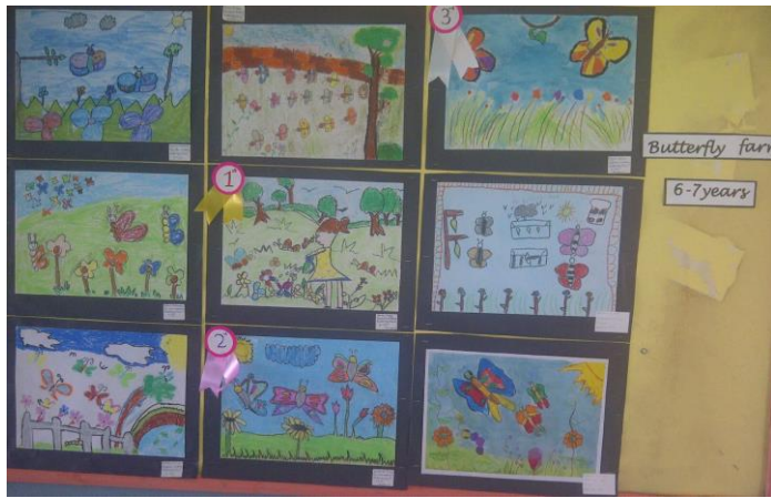
Some Student Art – Coast Academy Art Competition

Finally, we certainly look forward to seeing you at many of our end of term events. In the meantime, we wish you a peaceful and relaxing week-end.