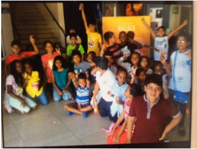
Year 4 and 5 at Cinemax – Saturday 21 st November