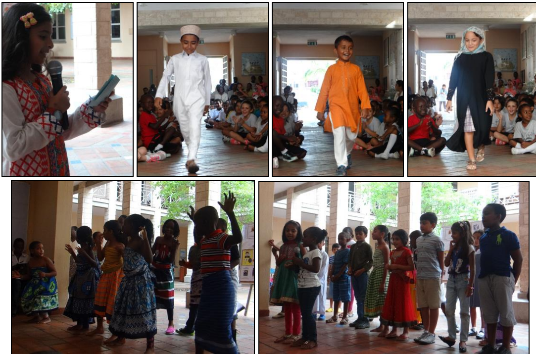
Year 2 Assembly – 20 th November

On Friday 20 th November, the Year 2 students presented a delightful and colourful assembly exploring aspects of cultures and connected these to their current Unit of Inquiry on How We Express Ourselves (Patterns). There were musical pieces and dance, as well as a fashion show of local dress emphasizing patterns found in local prints and cloths.