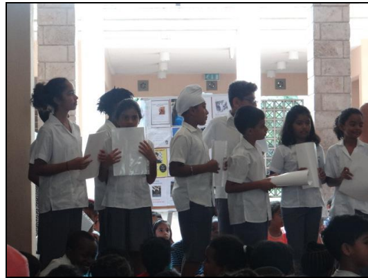
SRC Executive members receiving their certificates