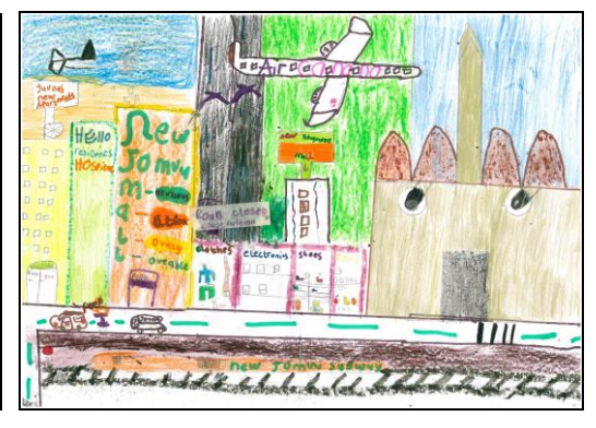
Art pieces - Mombasa in 2040