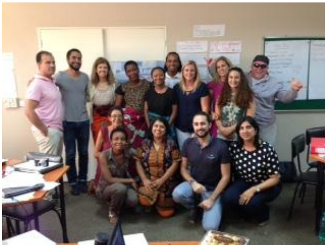
PYP Workshop, Staff from the Aga Khan Academy, Maputo