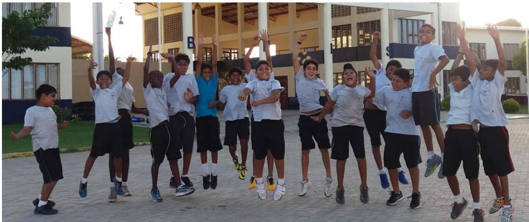
The U11 Cricket Team

On Tuesday 10 th November the U11 team went to Braeburn and played against them. AKA, M won the toss and set a target of 89 runs in 8 overs, and got 5 wickets. Braeburn scored 51 runs in 8 overs. Well done to the team for their achievements and representing the school.