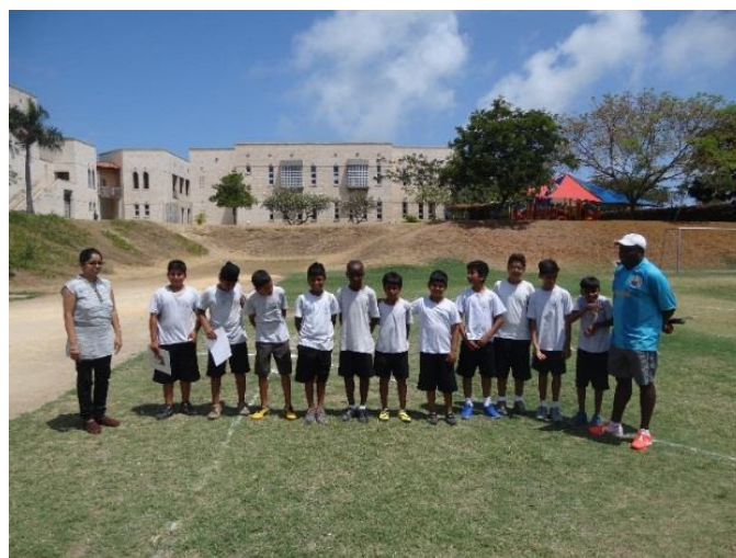
AKAM U11 Cricket Team