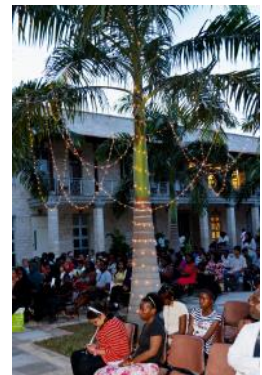
Christmas tree lighting