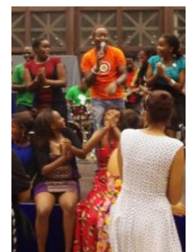
Eric Wainaina performing to an enthusiastic audience