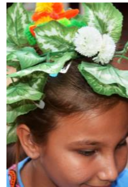
Junior School Crazy Hair Day