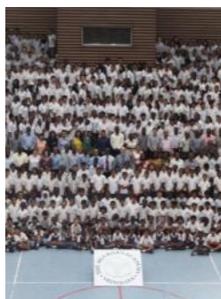
Whole school photo, on sale for 400KShs