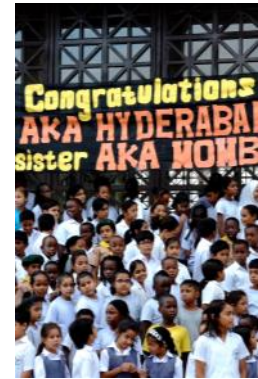
The “big sister” congratulates the “little sister”