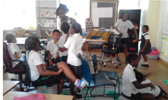
Drama – performing a skit