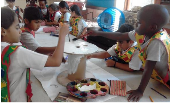
Arty Crafty – painting seating spools