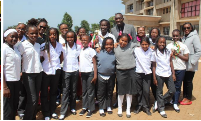
The Junior Choir at Dedan Kimathi Institute of Technology, Nyeri