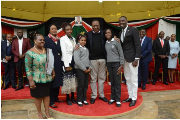
At State House, Nyeri