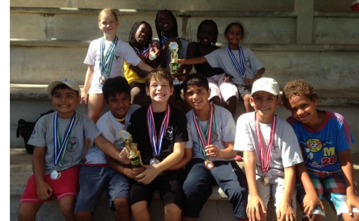
AKAM Under 9 Swimming Team

Just a quick message to let you know that both swimming teams - Aga Khan Academy girls and boys - took first runner up in boys' and first runner up in girls' categories in this weekend's CASA swimming gala - great achievement as competition was tough and our team was not very big. Most events/age groups saw AKAM students on the podium. Kudos to all swimmers and coaches as well as their parents who well supported their kids despite the heat!