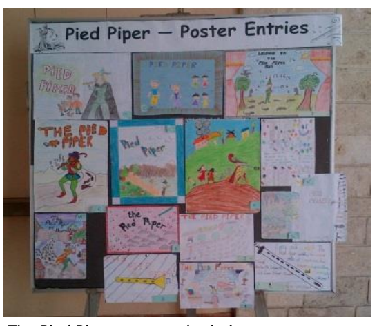
The Pied Piper poster submissions