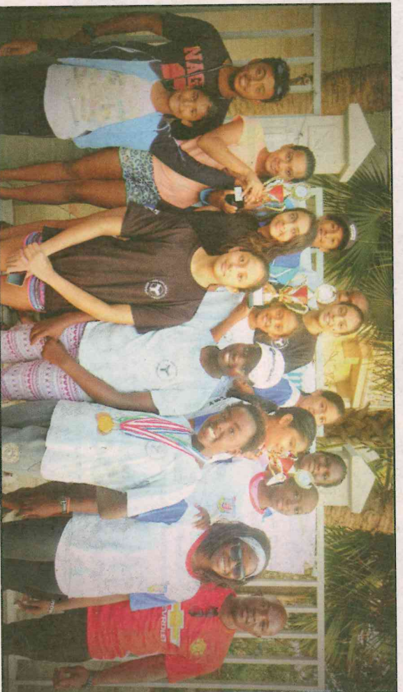
[LEFT] Aga Khan Academy Mombasa were first in the girls' category, Mombasa Academy took second place and third place went to Oshwal Academy Mombasa. [RIGHT] Bandari Swim Club were first in the boys category, Nyali Primary School took second place and third place went to Aga Khan Academy.