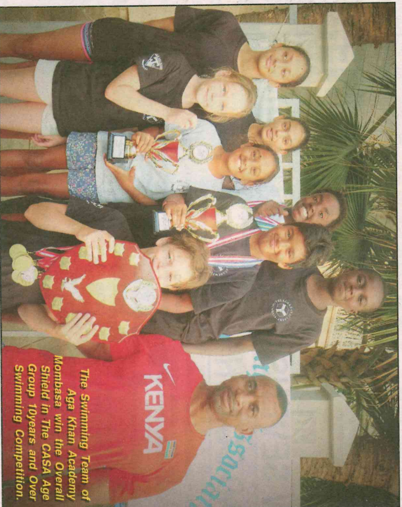
The Swimming Team of Aga Khan Academy Mombasa win the Overall Shield in The CASA Age Group 10years and Over Swimming Competition.

NOTE: Standard Port is Kilindini ADD 40 minutes for Lamu and ADD five minutes for Malindi. No Change for Kilifi and Diani.