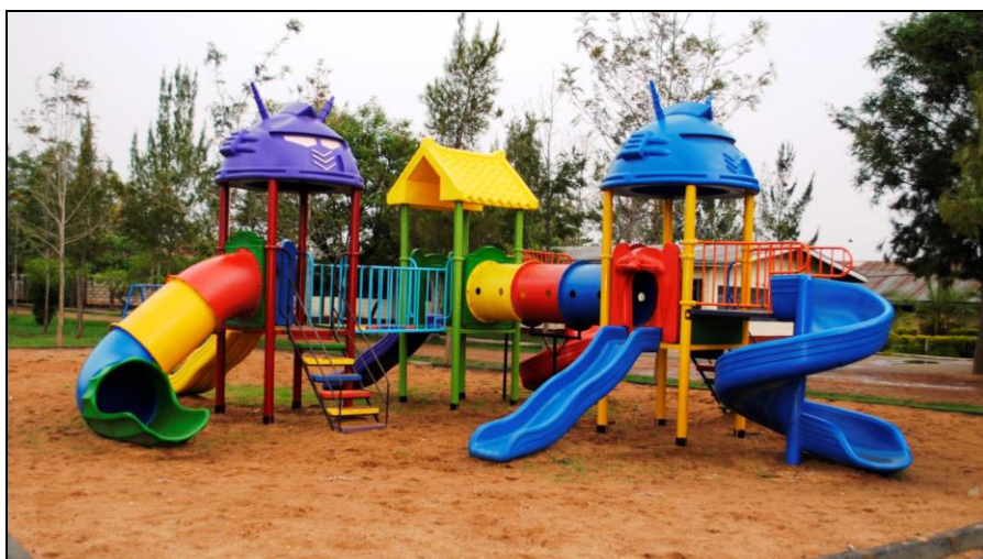
A sample structure...

Over the holidays, work started on dismantling the existing jungle gym in the school playground which has suffered wear and tear from the past years. We are currently looking at replacing it, much to the students' delight. We will be working closely with the class representatives to decide how to go about finding out from the students which new playground structure they would like to have.