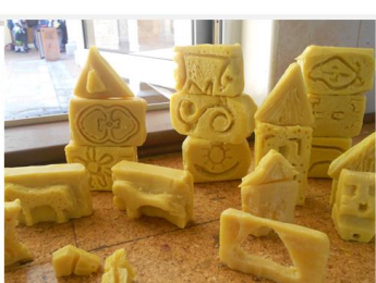
Soap carving - finished products