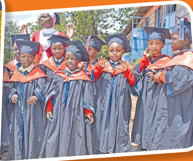
Pupils at Wells of Hope School Kangemi, Nairobi during the 2019 graduation day at their school last week.