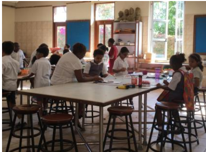
Art & Crafts workshop