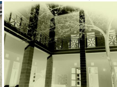
A student's photo