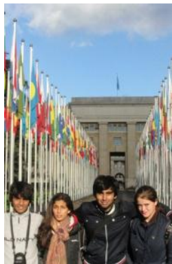
Outside the United Nations