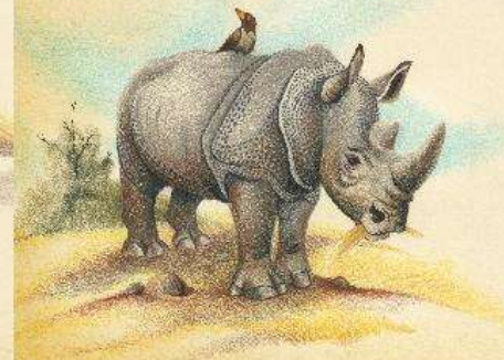
Imani - Honesty