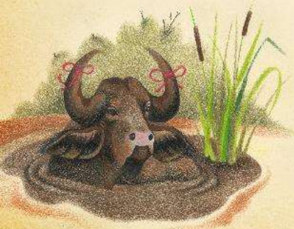
Bakai - Generosity