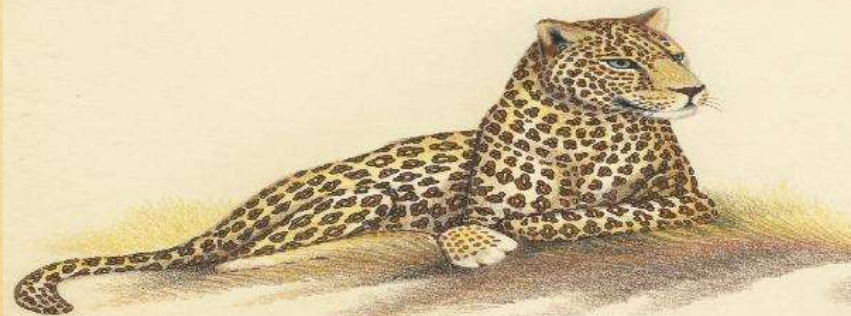
Elewe - Respect