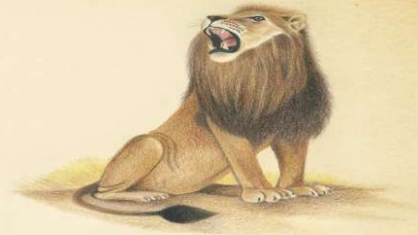
Safari - Perseverance