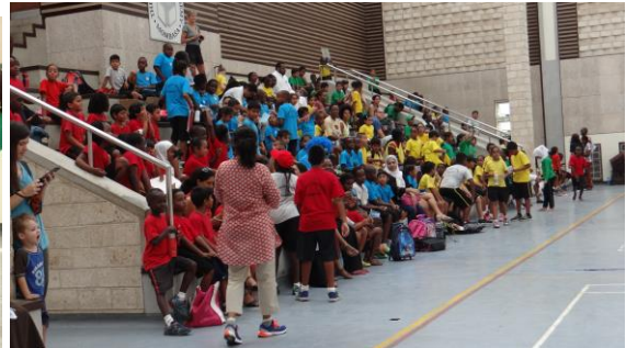
The Junior School