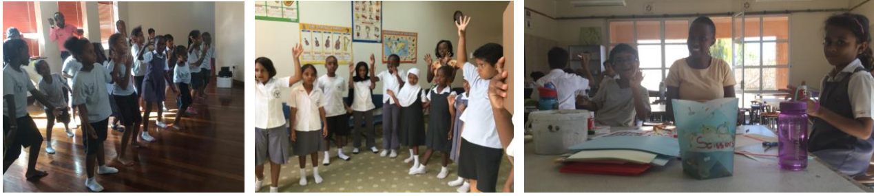
Some Arts Week activities ....