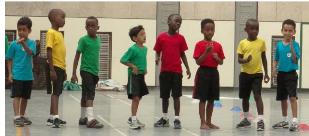
Get ready ...