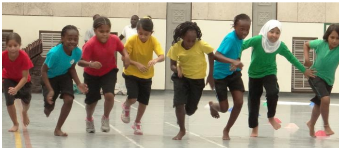
Year 3 race