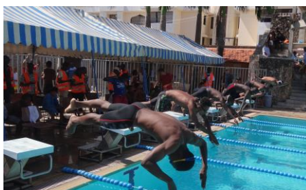
CASA Age Group Swimming Championships – 10 Years+ - 9 th – 11 th October